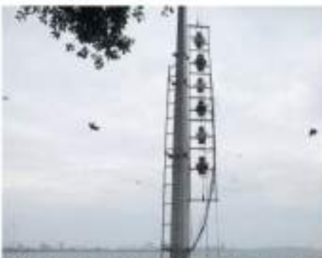
BMC might issue its unlocking guidelines today, but implementation will happen only after Thursday depending on what the situation is after the cyclonic storm.

All coastal cities and districts — Mumbai, Thane, Palghat, Raigad, Ratnagiri and Sindhudurg — have been put on high alert. The state disaster management cell, relief and rehabilitation department, Coast Guard, Indian Navy, Air Force and Army, National and State Disaster Management Relief, state police, weather department and all other agencies concerned have been placed in coordination with each other. District collectors have been directed to monitor and coordinate with the state gov-