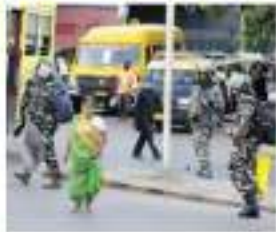
CISF personnel deployed at Chhatrapati Shivaji Maharaj Terminus (CST) station in Mumbai to contain the spread of COVID-19.

COVID-19 TICKER 70,013 TOTAL CORONAVIRUS CASES IN MAHA AS OF TODAY