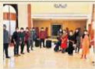
The doctors from Kerala who will help doctors at Seven Hills hospital