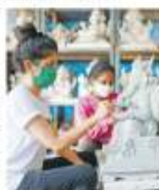
Two young women work on a Ganesh idol at the Arnd Arts workshop at Prabhadevi. Idol makers in Pen said this year they have made fewer than 50 per cent idols.

"Our business has suffered very badly in the pandemic but nothing much can be done because globally everyone has been affected. The Ganapati idol sellers from Mumbai have been approaching us but we are only taking online orders. The grampanchayats in Pen have decided not to allow people from Red zones to come to our villages, because we don't want the disease to spread there. We have told