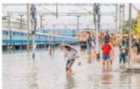
Passengers walk on waterlogged rail tracks at Ernakulam Junction station in Kerala during rains last year.

to social-distancing norms, while traffic snarl was noticed in many places as the lockdown relaxations come into effect in West Bengal on Monday. Many shops across the city that remained closed during the lockdown also reopened during the day. As the Delhi government on Monday removed the restrictions on the number of persons travelling in four-wheelers, two-wheelers, auto-rickshaws, e-rickshaws and other vehicles in the city, Transport Minister Kailash Gahlot urged all to maintain social distancing.