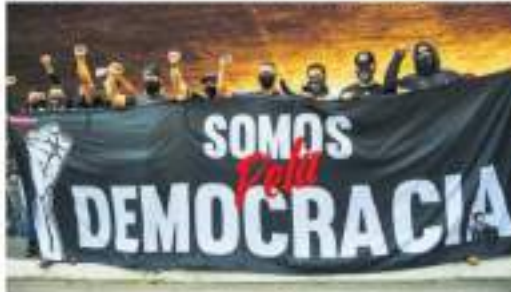
Football fans protest against anti-Brazilian President Jair Bolsonaro with a banner reading 'We are for democracy' in Sao Paulo. (right) a woman shouts slogans during a protest against the killing of black people amid the pandemic in Rio de Janeiro, Brazil, on Sunday.

On Sunday, hundreds gathered on the square near the Rio de Janeiro state government palace to protest against the crimes committed by the police against black residents living in city's working-class neighbourhoods, known as favelas. Al Jazeera reported. Several also shouted slogans in solidarity with the anti-racism demonstrations in the US.