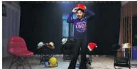
Each participant will build their own narrative on the spot based on a theme

FROM June 15 LOG ON TO joyofdrama.com COST: ₹3,500 for members and ₹4,500 for others