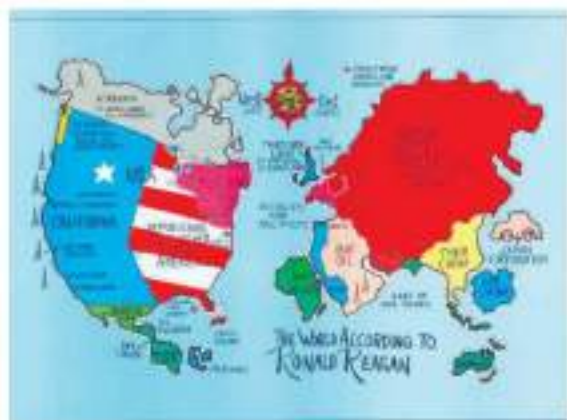
A twisted world map called Reagan's World captured America's ignorance and ego together

Maybe you think you're well-travelled and worldly. I guarantee you won't get more than 3 out of these 12 questions right