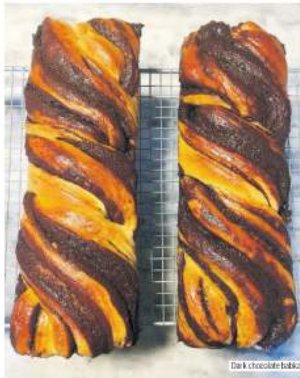
Dark chocolate babka