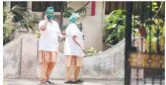
Nurses have to wait for up to nine hours to get admitted to COVID hospitals, the organisations said in the letter to BMC chief.

tious. Despite several requests, they have still not given us milk and multivitamins to boost our immunity. The doctors don't come around often either. We took care of COVID-19 patients when we were fit, but now when we need help, we are being ignored."