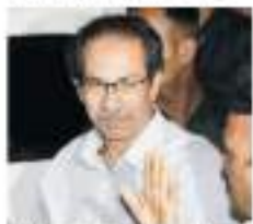
The Thackeray family members, as animal lovers and the chief minister has had many pets.