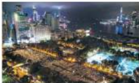
People attend a candlelight vigil in Hong Kong to mark the 32th anniversary of the 1989 Tiananmen crackdown in Beijing.

China has reported 32 new Coronavirus cases taking the total count to 83,017 infections, the health authority said on Monday. Wuhan has not reported any asymptomatic case but 320 are still under quarantine.