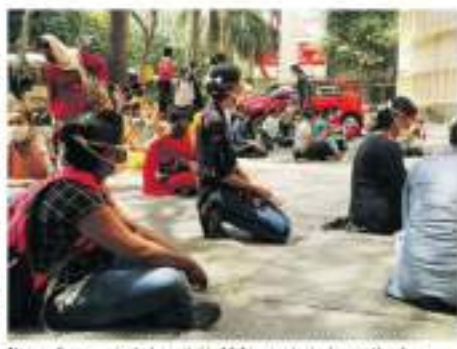
Nurses from a private hospital in Maharashtra protested recently when some were sent to a strict quarantine centre which lacked hygiene and facilities, while some doctors were kept in the hospital itself

Speaking in mid-day, a nurse who resigned recently from a private hospital in Mumbai Central, said, "I usually, by rotation on completion of tenure, I two years of contract (bond) the staff nurses usually resign. However, due to COVID-19 many nurses had to stay back and went through harrowing experiences with hardly any support coming from the hospital management,