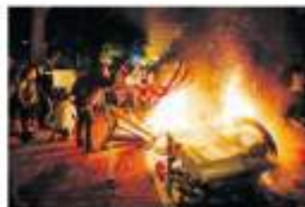
Demonstrators start a fire at night near the White House in Washington. (right) a young boy takes part in a demonstration against the death of George Floyd, in Atlanta, on Sunday.

Some of the protests have turned violent, prompting the activation of the National