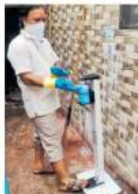
The dispenser is installed outside common toilets in slums.

BMC installs as many as 40 machines outside common toilets to avoid direct contact with the containers in an effort to stop the spread of novel Coronavirus