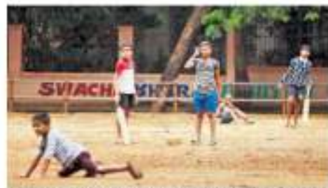
Children play cricket at Five Gardens, Matunga, on Monday.

'We have studied to work amid a severe health crisis but not at the cost of lives or that of our families' A doctor