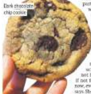
Dark chocolate chip cookie

ations small and continue with this approach for the coming months. The only hitch is the availability of baking ingredients. "The market in Colaba is shut, and I've had a hard time procuring even basics like eggs. Either I get delivered none or suddenly have 200 coming at once from different suppliers,"