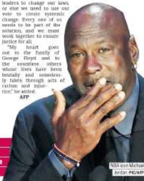
NBA icon Michael Jordan #CJAP