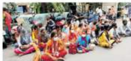
Fired contractual workers protest outside in Virar.

amid the crisis as several interns have not reported to work and in some conditions, we have handled COVID-19 positive cases singlehandedly in the absence of senior doctors. Yet we don't get paid," the doctor said.