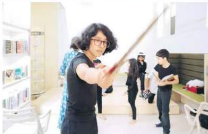
The workshop will cater to children from three age groups and will be divided into five themes