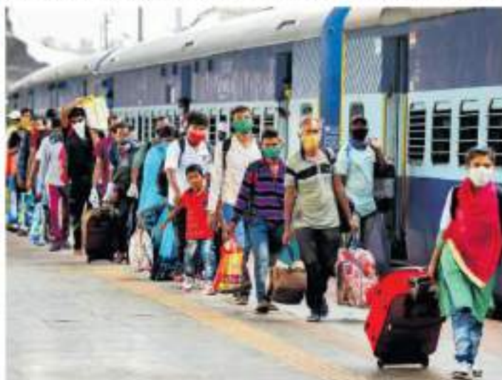
Migrants walk in a queue after getting off a special train at Howrah station on Monday.

The expected benefits of this stringent nationwide lockdown was to spread out the disease over an extended period of time to flatten the curve and effectively plan and manage so that the healthcare delivery system is not overwhelmed. This seems to have been achieved albeit after four lockdowns with extraordinary inconvenience and dis-