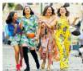
Cast from Four More Shots Please