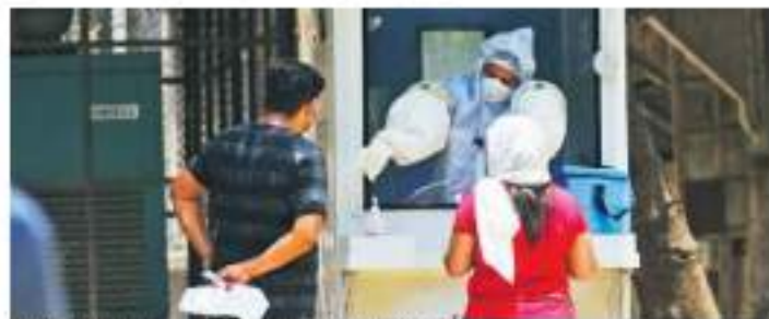
A COVID-19 testing booth at KEM Hospital.