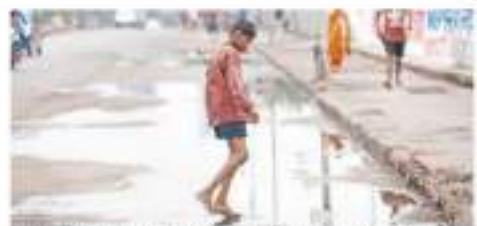
A boy walks through a puddle left by the first shower of the season in the city at Wadala on Monday.