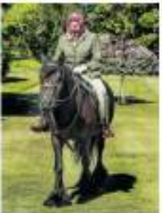
Britain's Queen Elizabeth II, 94, who has been self-isolating at Windsor Castle in England during the COVID-19 lockdown, was seen riding a 14-year-old Fell Pony called Balmoral Fern in the sprawling grounds of her royal residence in Berkshire over the weekend.

The US will consider rejoining the World Health Organisation if it ends corruption and reliance on China, the White House said on Sunday, two days after Donald Trump ended US's relationship with the WHO and accused it of being hand in glove with China in sharing inaccurate information to the world about the pandemic. "... If the WHO reforms and ends the corruption and ends the reliance on China, the US will very seriously consider coming back," US NSA Robert O'Brien said.