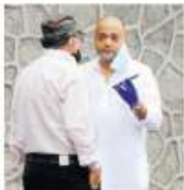
Brother Sajid at Wajid's funeral

Sajid-Wajid made their Bollywood debut with Salman Khan's Pyaar Kiya Toh Darna Kya (1998) and went on to work on the actor's various films including Gory, Tere Naam, Mujhse Shaadi Karogi, Partner, Veer and the popular